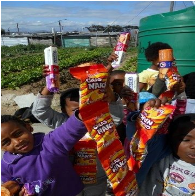
More happy chappies