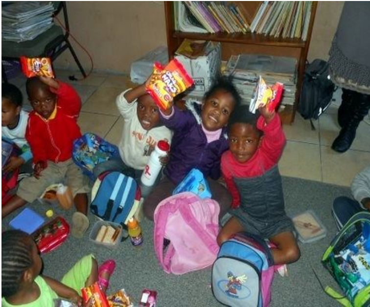
Some happy chappies from One Source Restoration Centre in Eerste River