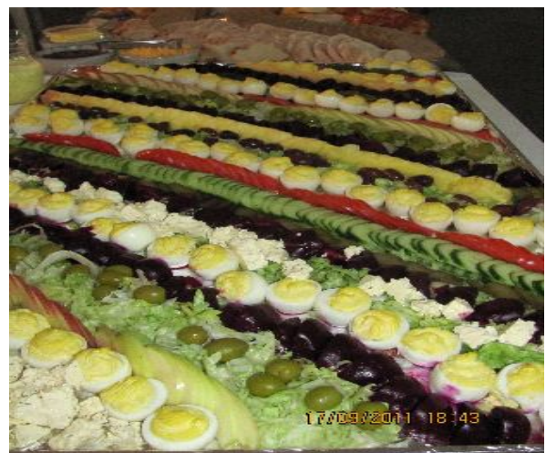
The dinner salad bar. WOW!