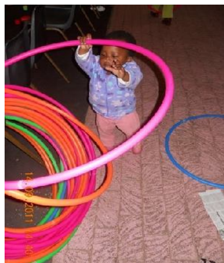
Some like to start young!