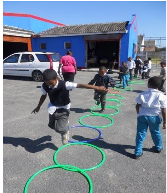
Hula Hoops get a work-out