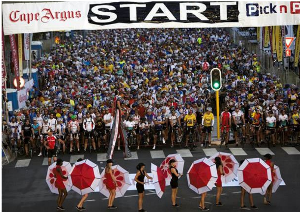
The start of one of the batches of riders in the 2011 Pick 'n Pay Cape Argus Cycle Tour – a sight the Bellville Rotary Club never sees

The 2011 Cycle Tour was run in ideal conditions. In spite of an adverse weather forecast, the day was as near perfect as one could expect. This made a very pleasant change after the last few years when high winds and the construction activity at the new Greenpoint Stadium made the going very difficult for both competitors and helpers. Such a high proportion of the riders who started actually finished the race that the organizers ran out of medals to give those finishing.