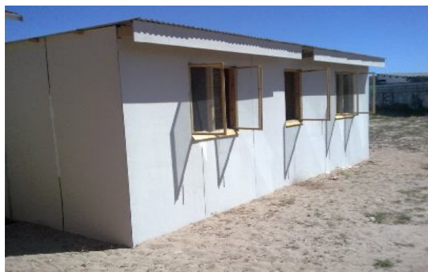
Outside rear view -note the lack of any sort of plants

I am pleased to report that the the Trauma Centre in Atlantis has been completed and the electricity and water connected. The date for the official handover is still to be announced. As can be seen in the photo below the area around the building is very bleak and some roll on lawn would not go amiss.