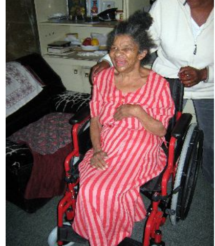
Sar Februarie of HeinzPark