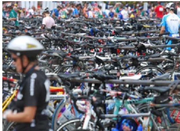
The main Cycle Park in full swing. It is hard to believe that only one bike was not claimed by the time the Park closed at 18h30