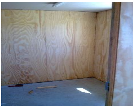
Inside one of the rooms