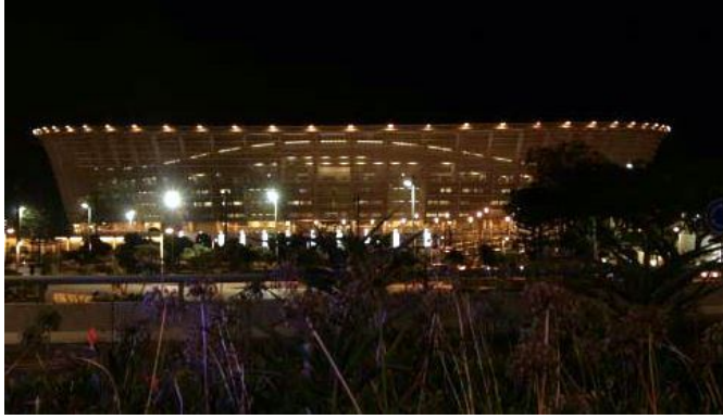
The imposing new Greenpoint Stadium before dawn