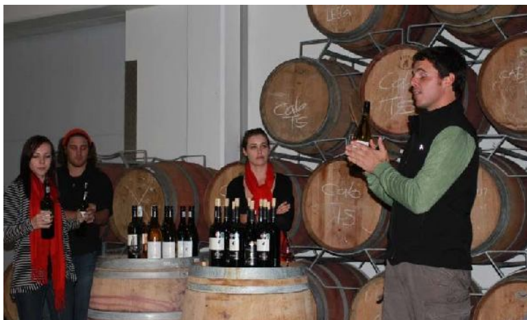
Our hosts for the evening -the Wine makers of D'Aria Estate