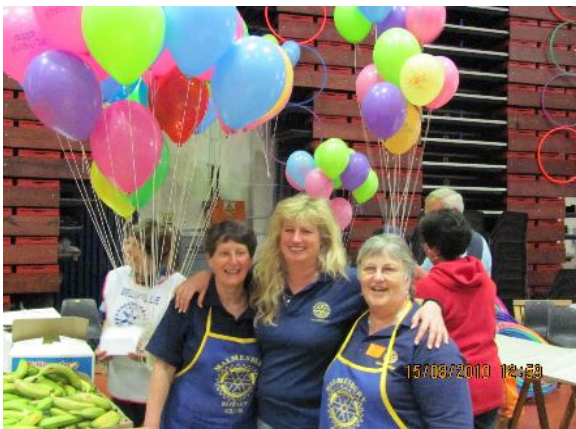
Our friends from the Rotary club of Malesbury