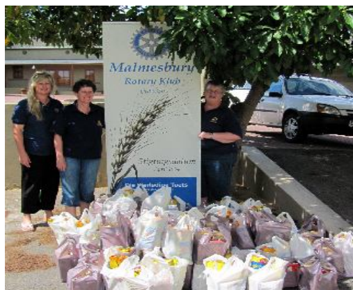
We were helped by our friends from Malmesbury Rotary

Our friends in the Malmesbury Rotary club assisted us and distributed to organisations in their area.