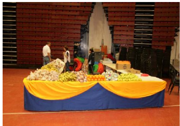
Our stand partially setup