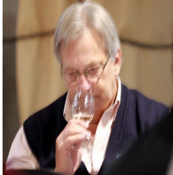
Malcolm nose what he is doing?