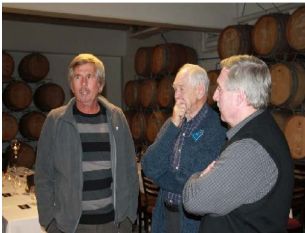
The 1st Team decides its strategy