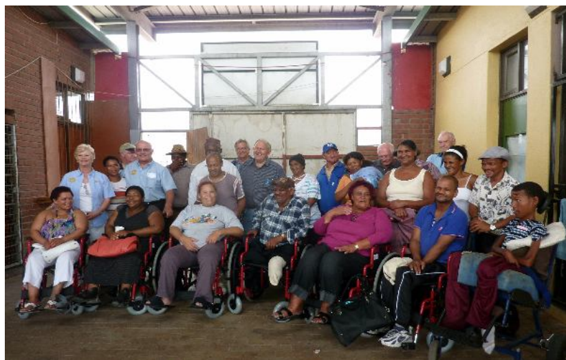
Wheelchair handover in Westbank Can you spot the Bellville Rotarians