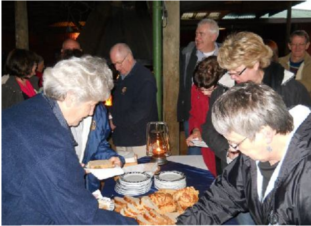
Everyone enjoyed the meal