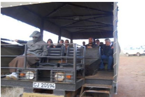
A load of Rotarians on their way to the "lapa"