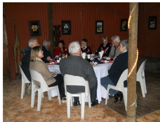
Early evening – still civilized